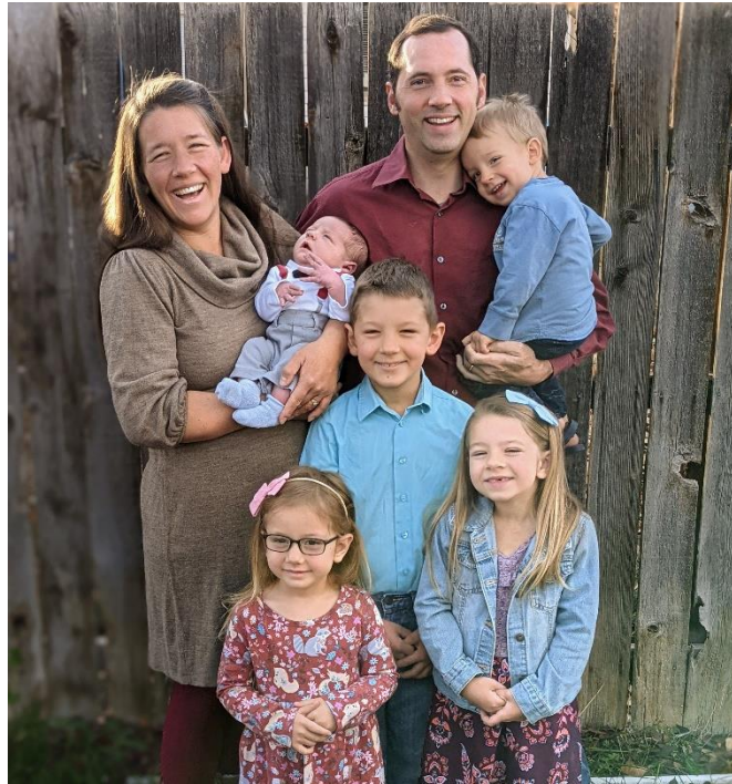
Missionaries for Alpha Omega Institute.

For Scheduling a Creation Science Apologetics Seminar