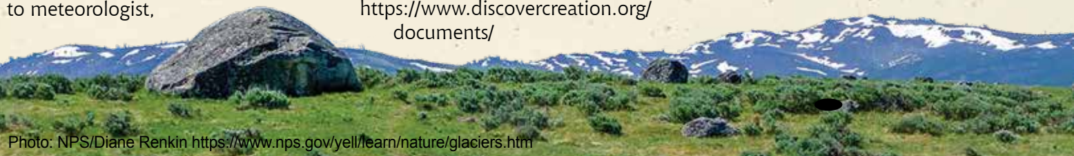
Photo: NPS/Diane Renkin https://www.nps.gov/yell/learn/nature/glaciers.htm