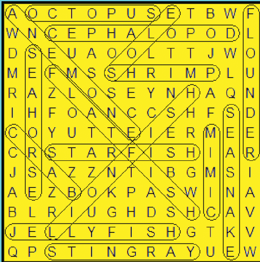
MIMIC OCTOPUS' NATURAL COLORS

ARMS BEAK COLOR INK LEGS MIMIC OCTOPUS SHAPE