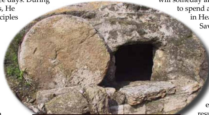
This tomb is AN EXAMPLE of what the tomb Jesus was buried in and arose from MIGHT have looked like.