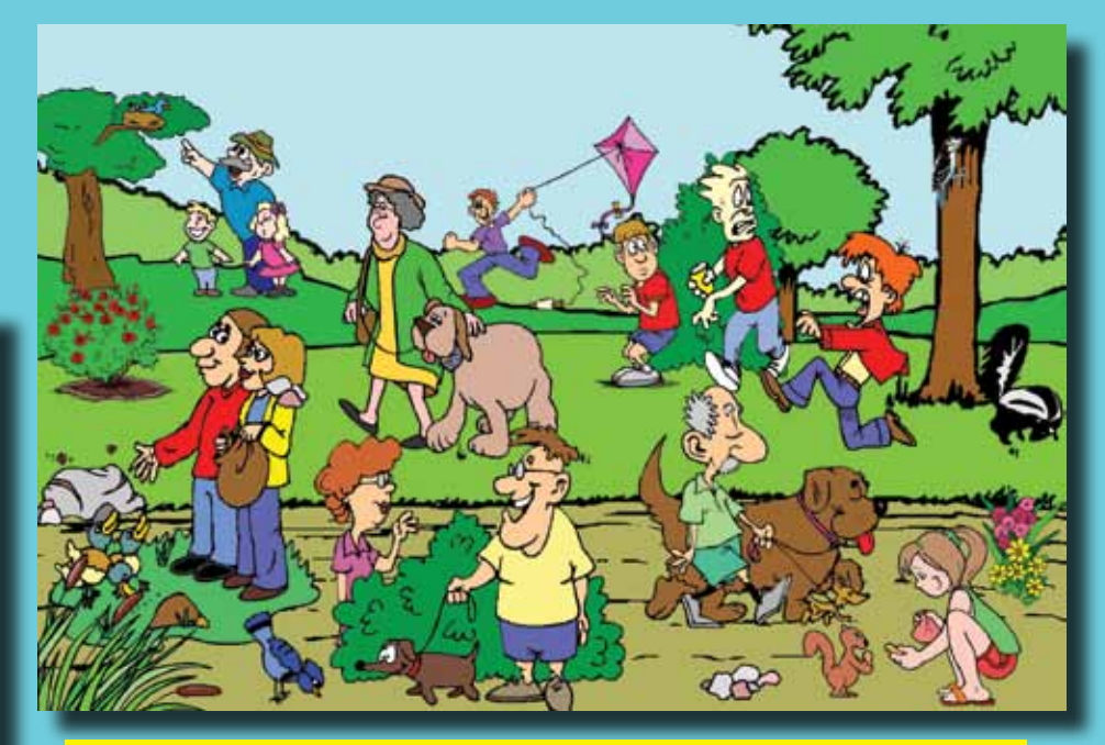
A skunk entering the park is about to upset everybody's day. Find the 18 differences between the 2 pictures