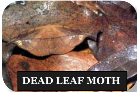
DEAD LEAF MOTH