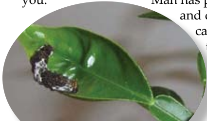
BIRD DROPPING CATERPILLAR