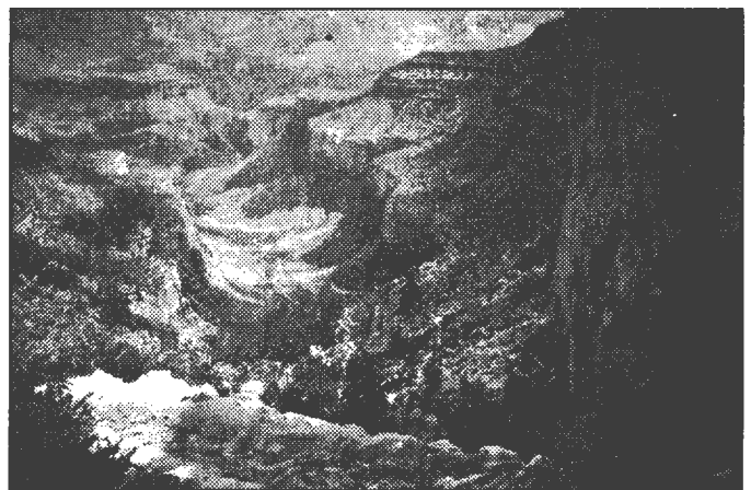
Grand Canyon: Monument to Catastrophe

One step at a time -- person to person -- we can reach out through words and actions. This involves sharing God's Word, exposing falsehood, correcting error, instructing in truth, and all the time undergirding our life with prayer and trusting that God will direct us in the way we should go -- one step at a time.