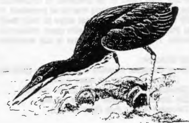
A Bird That Fishes?

Fish that live in darkness at great depths have some very interesting means of obtaining food. One, the Gulper Eel, swims along with its enormous mouth open, just waiting for something to swim in. It sort of reminds you of a trawler. A light on the tip of its tail evidently attracts the prey. Another, the Black Swallower, swallows its food whole and later digests the prey in its enormous stomach. It sometimes swallows fish even larger than itself.