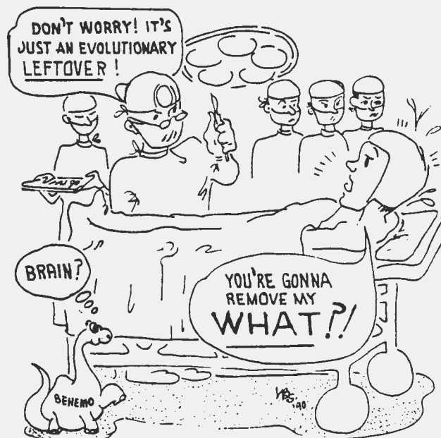
Evolutionary Leftovers? (See Spotlight on Science)