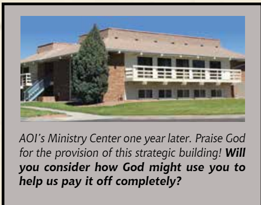
AOI's Ministry Center one year later. Praise God for the provision of this strategic building! Will you consider how God might use you to help us pay it off completely?

It is always good to think back and thank the Lord for what He has done! When we had our regular board meeting on May 24, one of our board members noted that one year ago we did not have our own building. He expressed gratitude in how our God has so graciously provided for AOI in just one year's time.