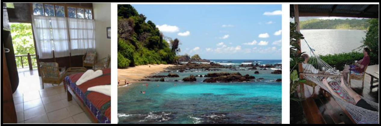
March 9, 10: Hotel Punta Leona