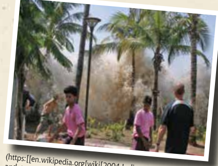
(https:[[en.wikipedia.org[wiki[2004 Indian Ocean earthquake_and_tsunami#/media/File:2004-tsunami.jpg)

exceeding 130 feet. When these waves crashed onto the coastline, huge surges of water headed inland and blasted apart thousands of homes and even large, multi-story buildings. Hundreds of thousands of people were drowned, crushed, or buried.