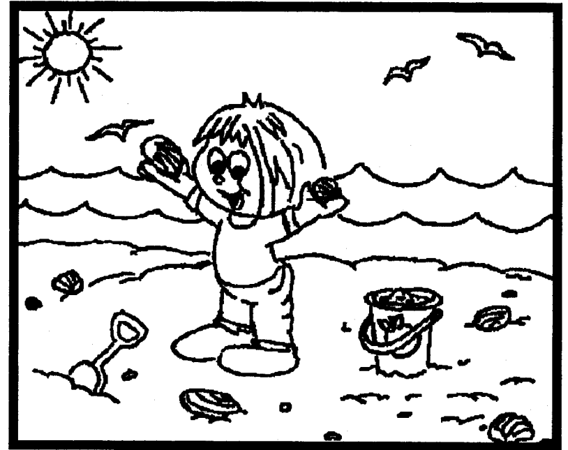
SALLY SEES SEASHELLS: Can you find the differences between the two pictures? There are at least 16 differences.

Look for the words in the puzzle from the words in the WORD LIST below. The hidden words might be up, down, sideways, or slanted (not backwards).