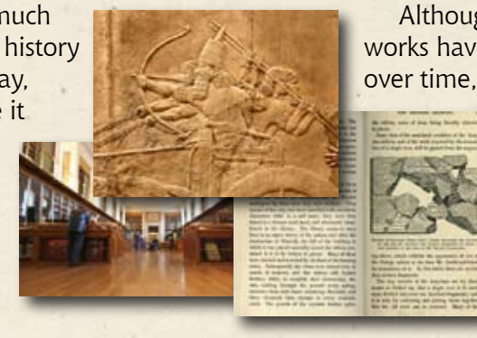
Relief of Ashurbanipal hunting lions, a sample page from The Chaldean Account of Genesis and the British Museum where much of the Assyrian works are displayed.