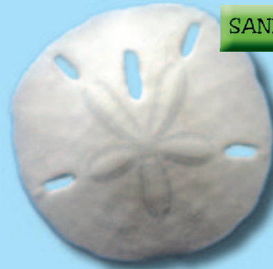
SAND DOLLAR TOP

This simple little symbol Christ left for you and me To help us spread his gospel Through all eternity