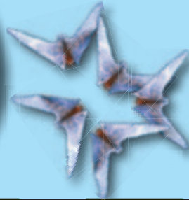
SAND DOLLAR "DOVES"