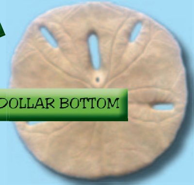
SAND DOLLAR BOTTOM