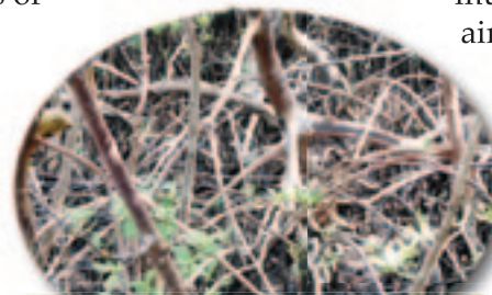
RED MANGROVE ROOTS

[Solve puzzle on back to see what Bible verse Mr. Jones read]