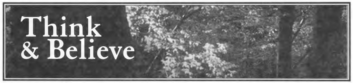
A Publication of Alpha Omega Institute