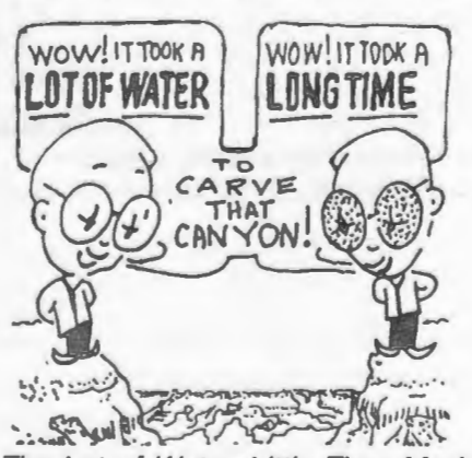
The Lot of Water→Little Time Model Holds A Lot of Water!

Is it possible that even the famous Grand Canyon (which textbooks say must have taken 13 million years to form) might be the result of a similar catastrophic process? A lot of water in a little bit of time can achieve dramatic results. (See T&B, May/June 1988.)