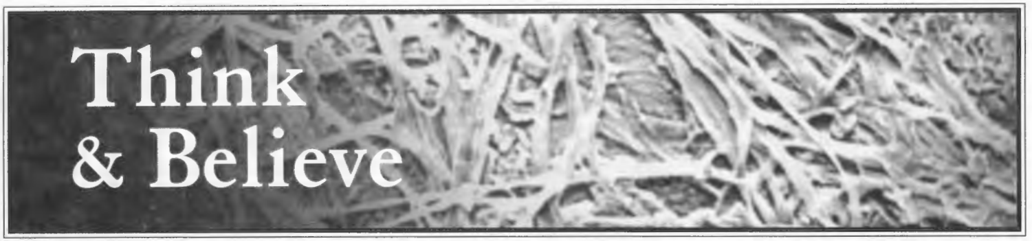
A Publication of Alpha Omega Institute