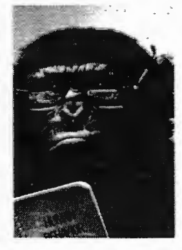
"I was just wondering, am I my brother's keeper or my keeper's prother?"

no transitions, fossil or living! What about all the textbook and museum pictures of transitional forms, then? We can only conclude that their originators have been duped into thinking the evidence really exists or that they are not as honest with the data as Colin Patterson was. The evidence shows monkeys have always been monkeys and people have always been people.